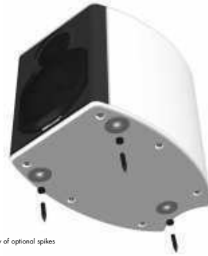
assembly of optional spikes

In order to realise the best performance from your Calliope loudspeakers, we recommend that you remove the grille cover. To do so, gently prise the side edges of the grille out of the enclosure relief channel starting at the bottom.