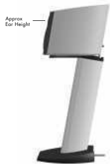
Calliope shown on its optional 'Aluminium Technology' stand (featuring cable management).

We recommend placing Calliope on the (optional) matching stands (see figure opposite).